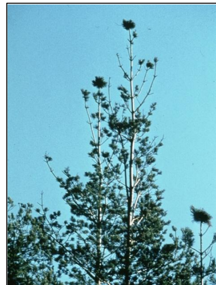
Thinning crowns due to pine shoot beetle damage

More than 20 years of research, regulation and management experience in the U.S. is available upon which to draw guidance for regulating and managing PSB in Missouri. However, we have some unique challenges. Missouri is located on the southern edge of the PSB range in the U.S., although PSB's distribution worldwide extends to more southern latitudes elsewhere. As the PSB expands its range farther south here, it is unknown how much the warmer climate will affect its biology and the annual timing of management activities. It is also unknown how PSB will behave when it enters the range of shortleaf pine ( P. echinata ) in southern Missouri and beyond. Studies in Ohio confirm that PSB can reproduce in shortleaf pine logs and can feed in shortleaf pine shoots. Another consideration is the occasional heavy defoliation by pine sawflies in southern Missouri. It's unknown if sawfly defoliation can stress shortleaf pines severely enough to allow PSBs to reproduce in them and thus build up damaging populations.