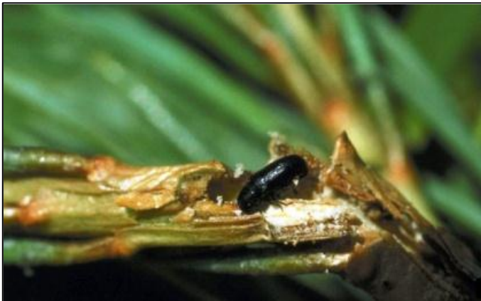
Pine shoot beetle adult tunneling in pine shoot

But unlike most bark beetles, PSB also has a shoot tunneling period during the adult stage. It is a primary colonizer for shoot tunneling, because it readily attacks healthy pines. Where there are severely stressed or recently dead pines in which PSB populations can build, the beetles can